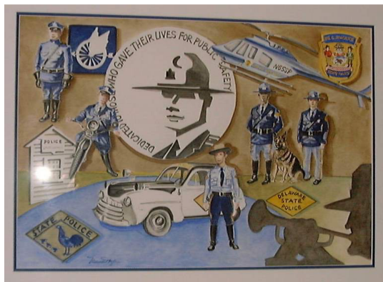
75 th Anniversary Collage