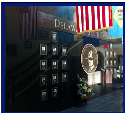
and the black granite Memorial Wall in the DSP Museum.