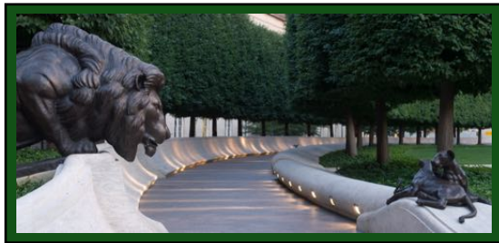
National Law Enforcement Memorial,