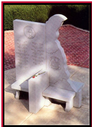
the Delaware State Police Memorial