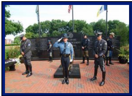
the Delaware Law Enforcement Memorial,