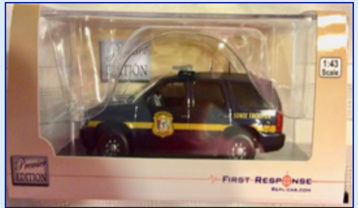
2013 DSP K-9 Tahoe