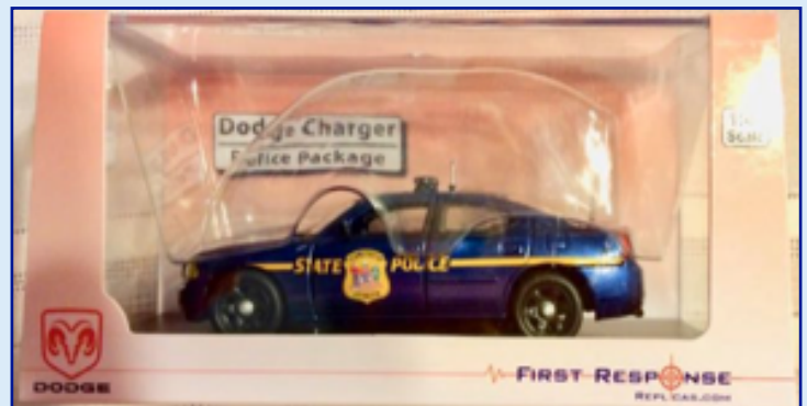
2014 Dodge Charger