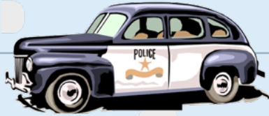
1998 75th Anniversary Crown Victoria