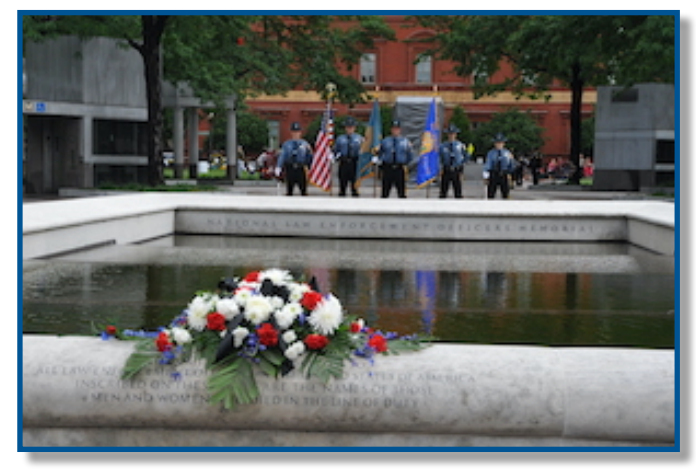
Honor ~ Valor ~ Service